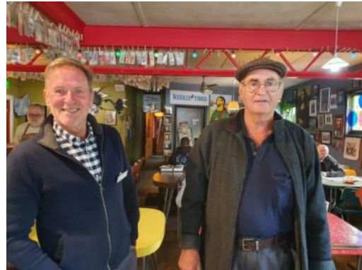
A couple of photos from our run to the Dover RSL