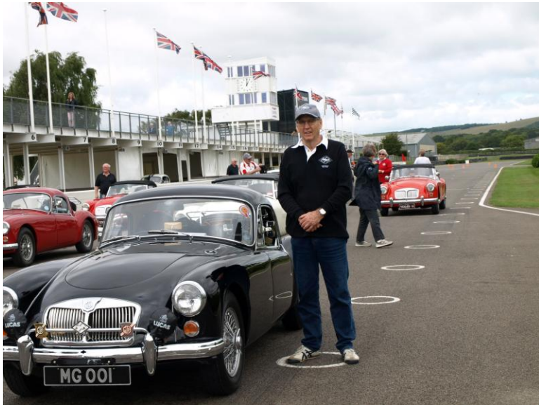
Col at Goodwood during the 2015 MGA60 Anniversary Tour - with part of the Australian contingent.