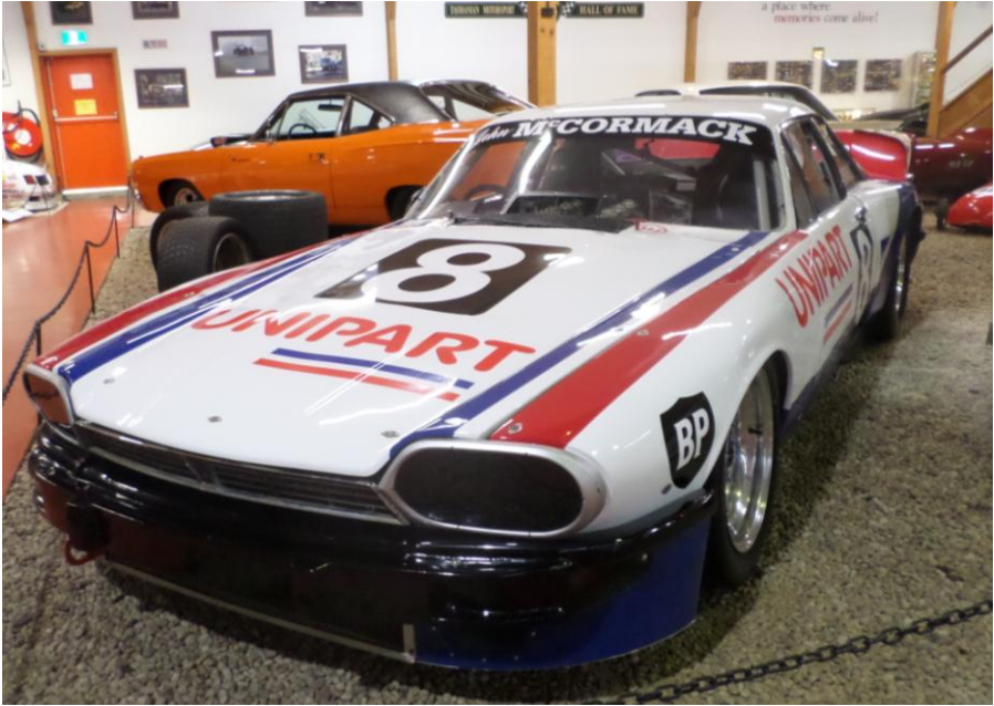
Two of the cars attending Baskerville, currently in Launceston Car Museum