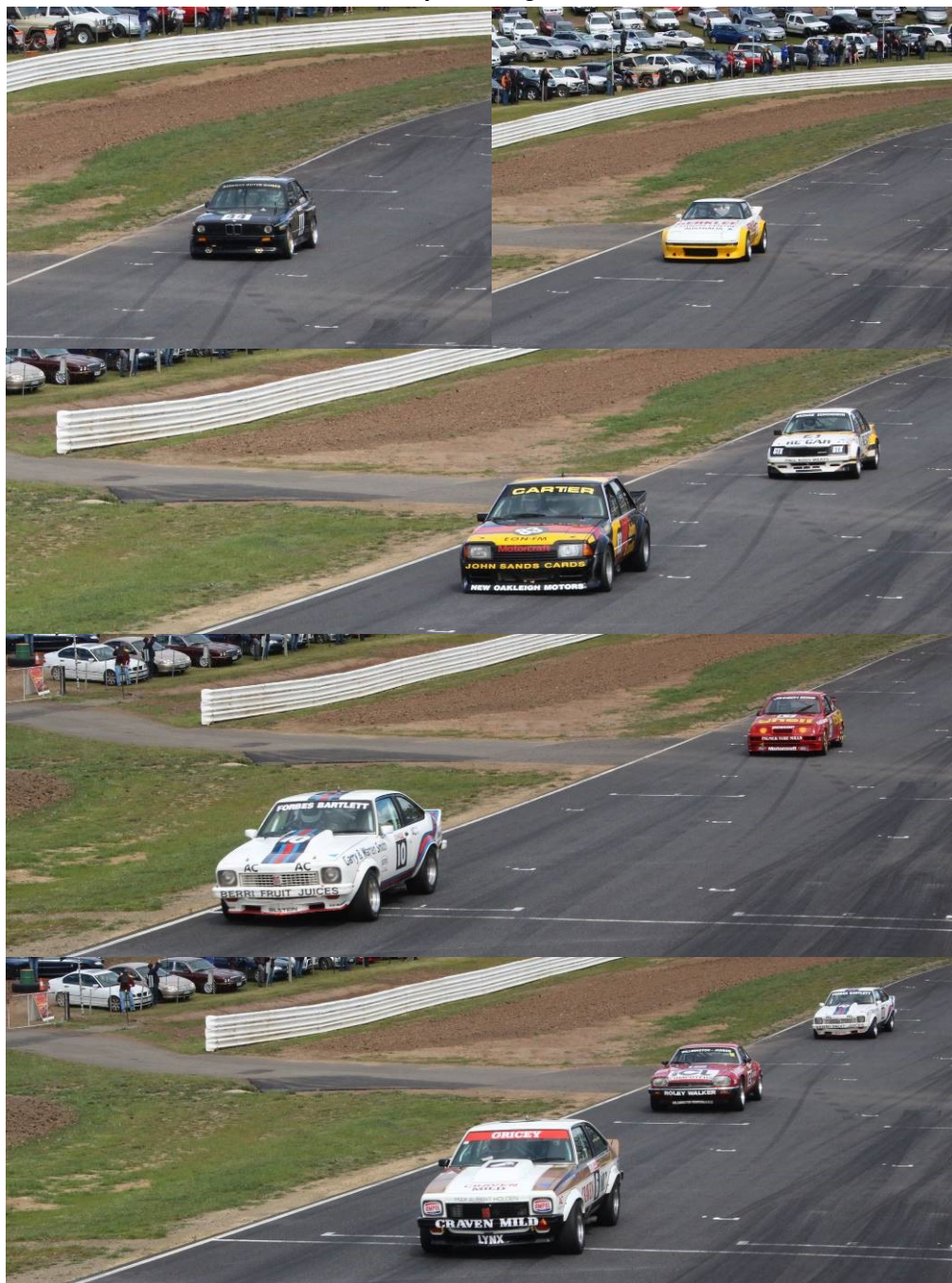
A Selection of the Group A and group C Cars in Attendance