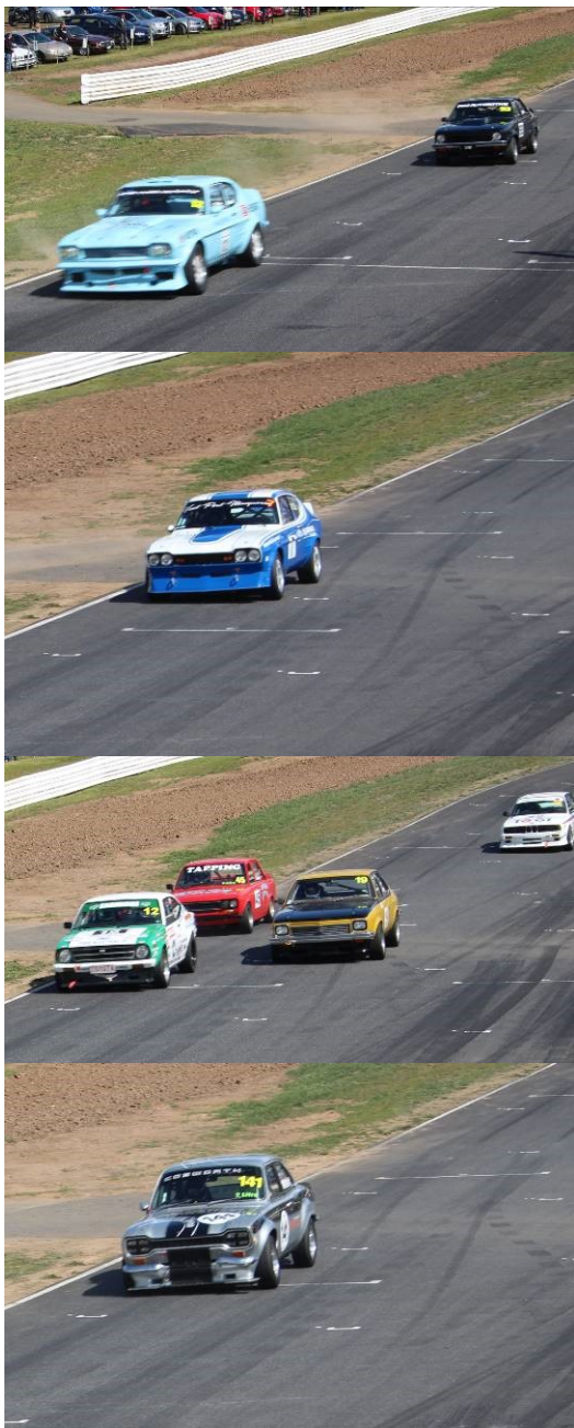
Selection of Cars in the Muscle Cup