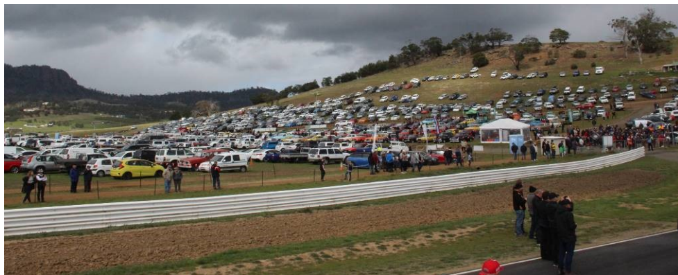
Above and Below – The Crowd on the Hill and the Pit Walk Lineup