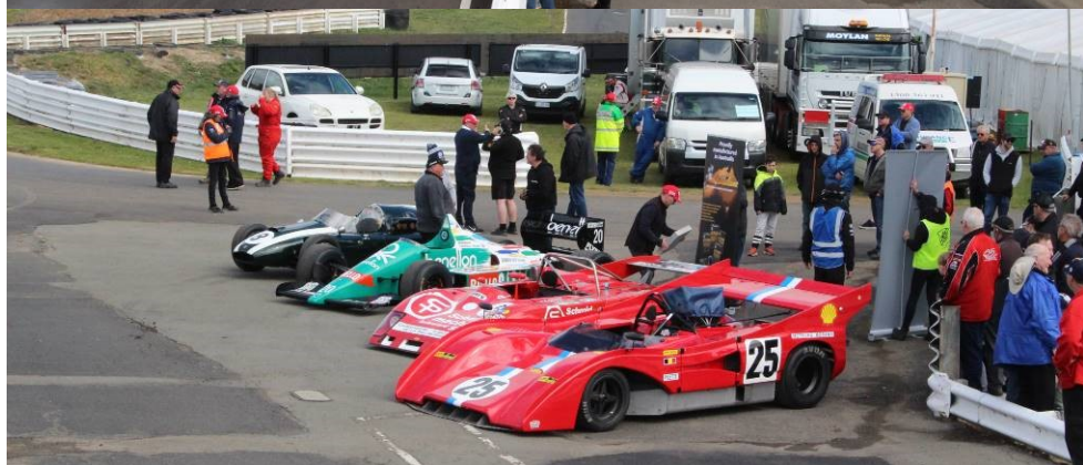
Bruce McLaren's F1 Cooper Climax, Gerhard Berger's F1 Benetton, The LeMans Lola and the McLaren M8R