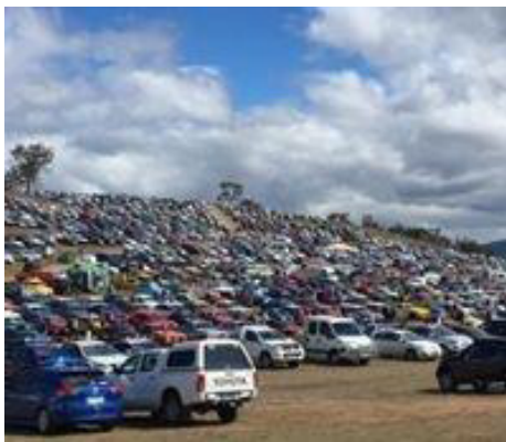
Baskerville, something on ?

Sunday was spectacular, producing some great duels on the track, a wonderful display of historic cars, and spectators on the hill as far as the eye could see. We have been waiting for this one for a long time now and it finally delivered. Thank you.