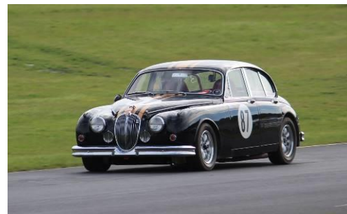
Brock Green (Vic)