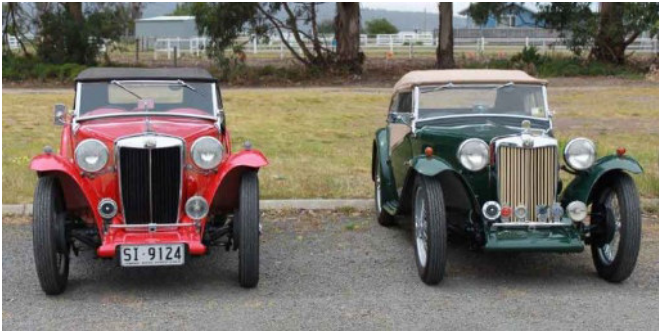
A Pair of T Types