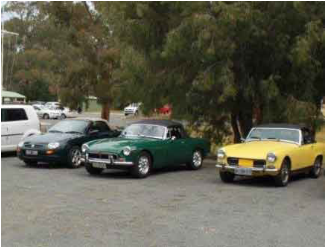
Photos from SSC Mid-Week run to South Arm RSL