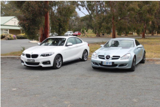
A Pair of Imports