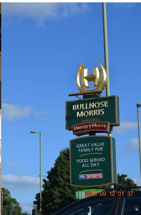
Divorce MG, Old Number 1, The Bullnose Hotel