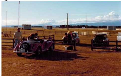
MG Car Club Day Symmons Plains 9-6-79