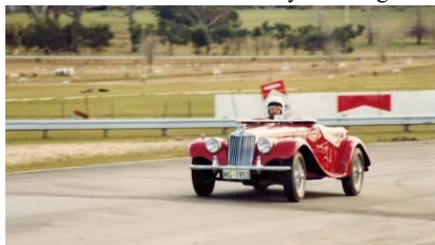
Symmons Plains Late 70's