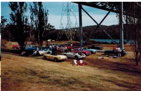
MG Run Batman Bridge Early 70's