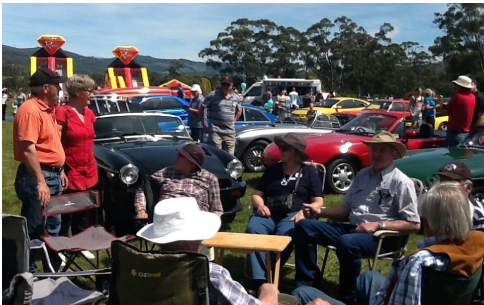
SSC members at the Huonville Fundraiser