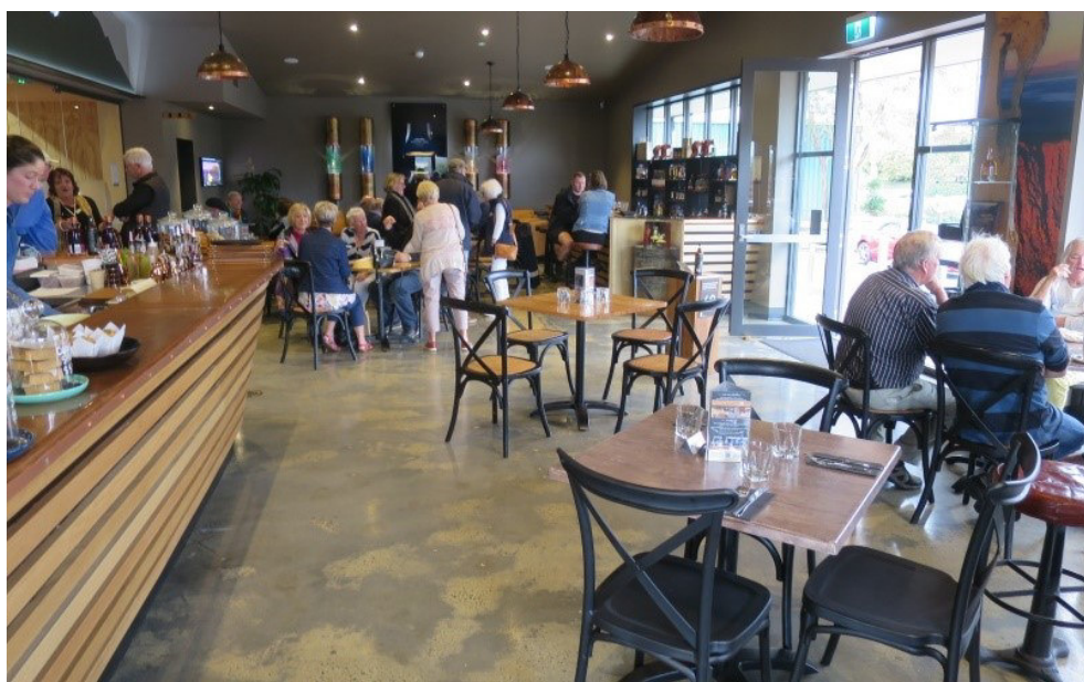
The Western Distillery Restaurant