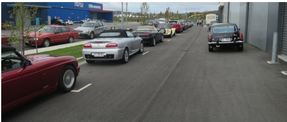
Cars down the side