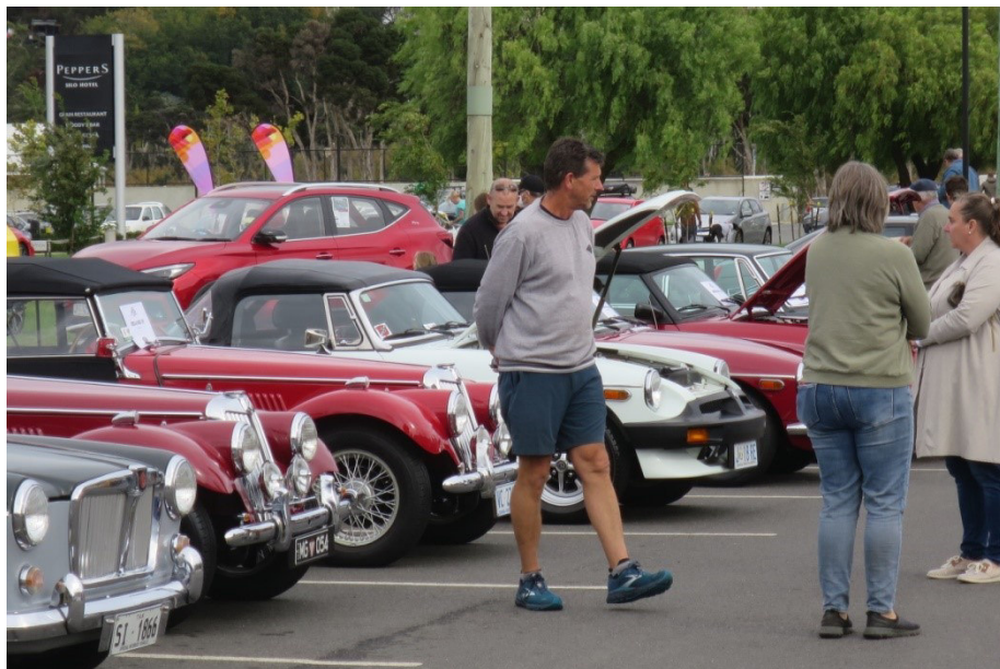
Cars and spectators