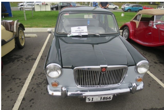
Bronwyn Zuber's 1966 MG 1100