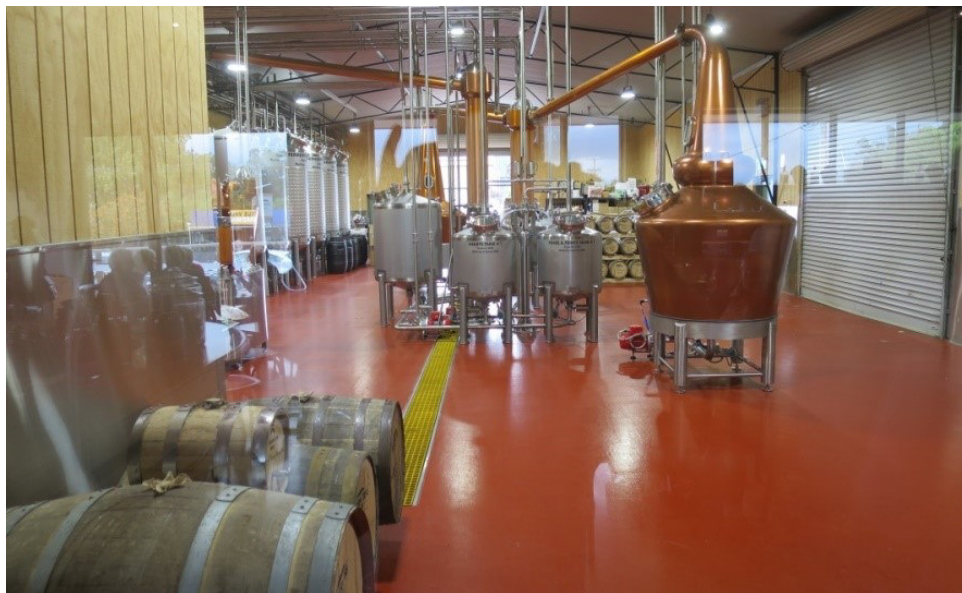
Where they make the Gin