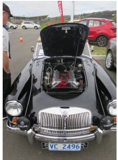
Col Cleavers 1959 MGA Twin Cam