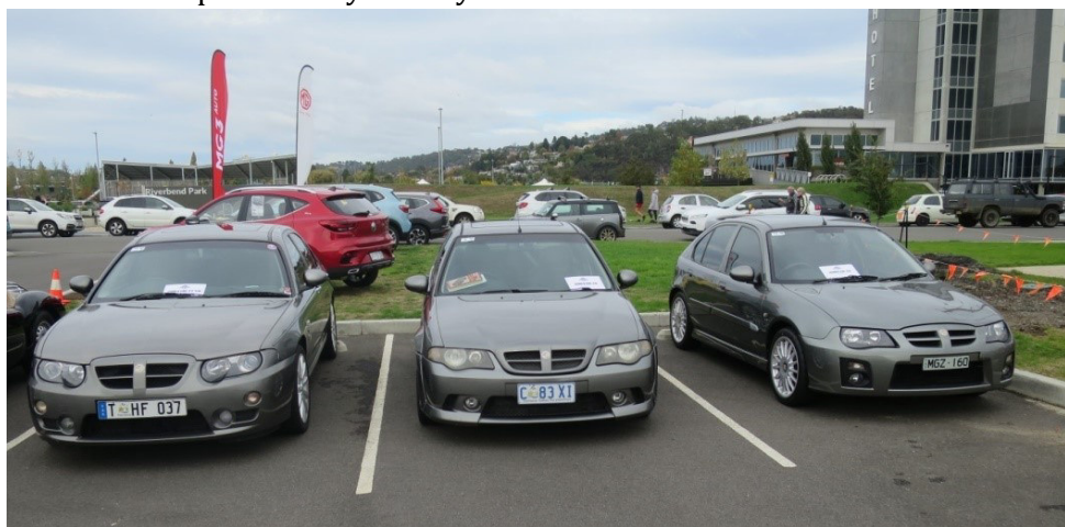
Three modern MG's, Terry Sansom's 2004 MG ZT 260 and 2004 MG ZS with Robin Wilmot's 2005 MG ZR