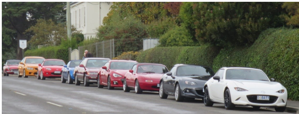
It's an MG run would you believe, spot the MG