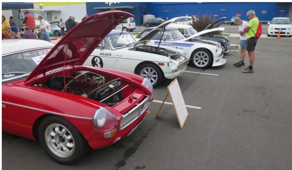
The crowds and the competition MG's which created a lot of interest over the day