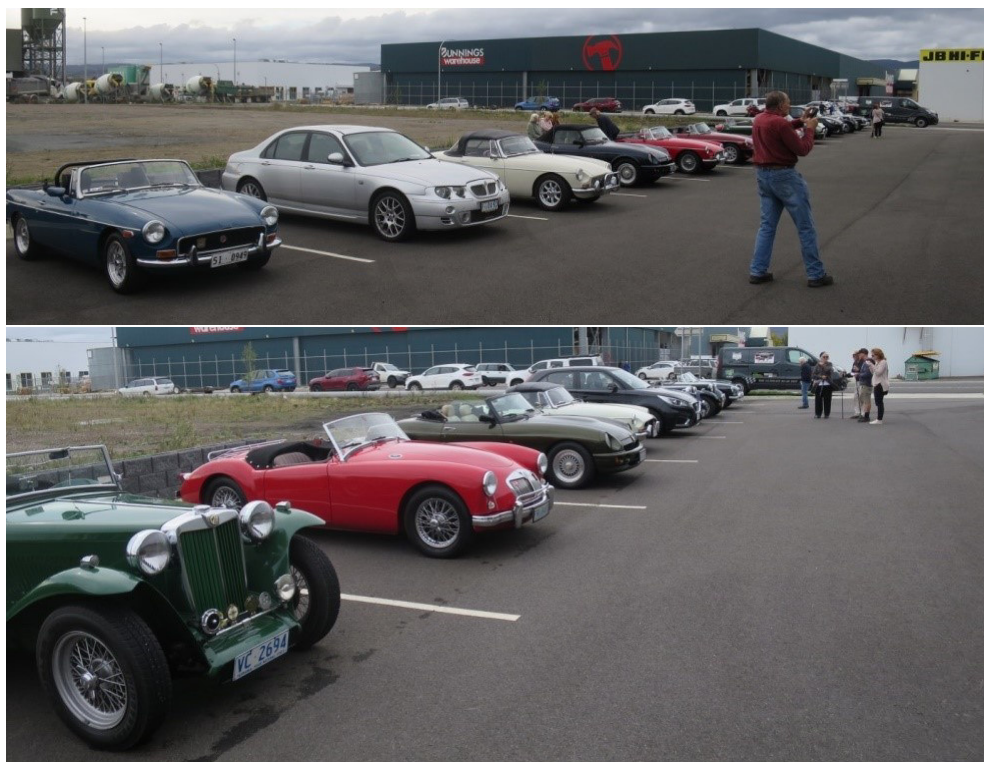
The lineup of MG's covering a number of models at the back of the Museum

Many thanks to the supporters of the event, The National Auto Museum of Australia in Launceston , Shannon's, Buckby MG, RJ Batteries, Independent Oils, Tas Petroleum, Penrite Oils and all those who brought along their cars on the day.