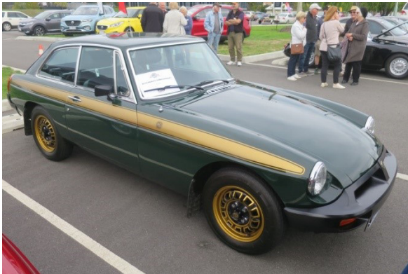
Col Cleavers 1975 MGB GT Anniversary Model