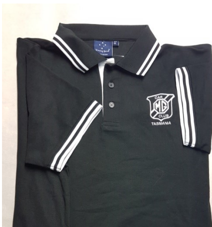
Ladies and Gents Polo Tops