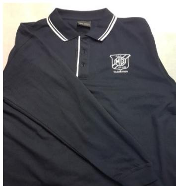
Long Sleeved Polo