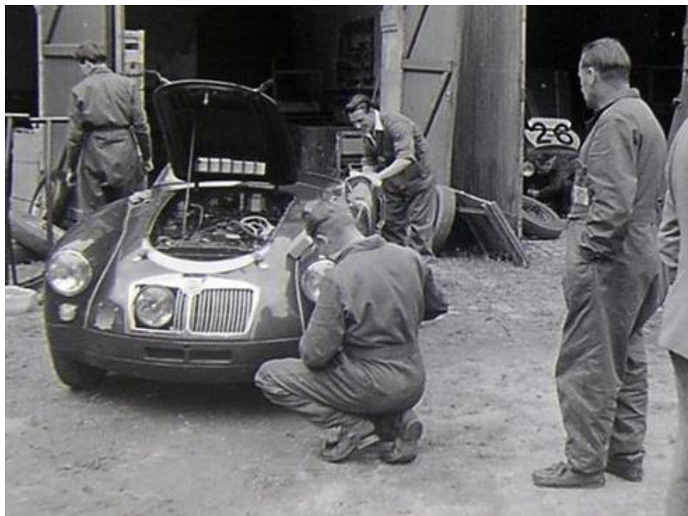
Le Mans 1955