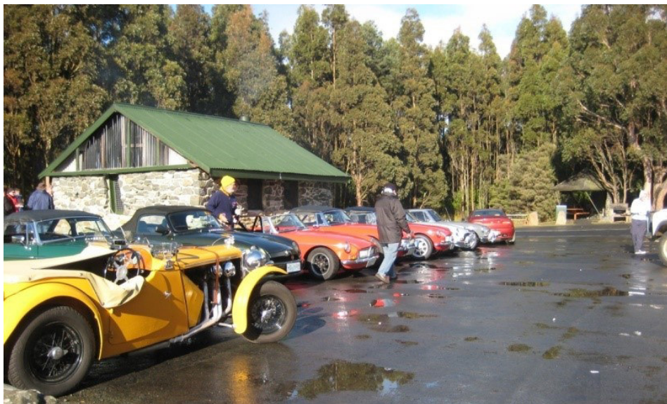
Herbie's Mountain Madness having breakfast at the springs half way up Mount Wellington