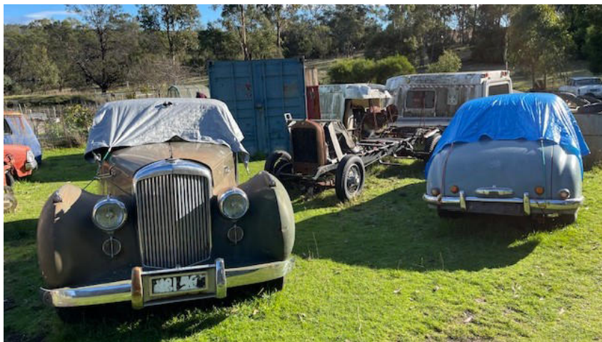
Bentley and Hudson waiting to be restored, with 'dead' MG Magnet.

Bruce is industrious and has acquired a broad knowledge of cars which I know first hand, he is only too happy to share. But there's always something to be done by this active person while Leonie maintains the garden, and projects waiting to be done include restoring a Bentley but it will have to wait until the 1927 Hudson and MG Y Type are completed. There's no rest in sight!