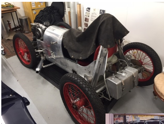
WGM 500 Australian Special. It raced in the 1956 Australian Grand Prix and was the first racing car in Australia to have disc brakes.