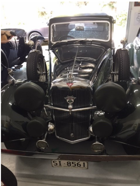
1936 Alvis Speed 25 Saloon.

Morris Minor 1000 fitted with a FWA 1100 Coventry Climax engine with a MG TA gearbox. (Not pictured separately)