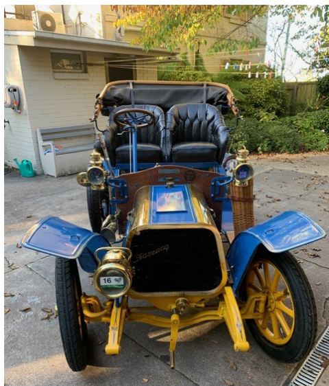
1905 Darracq single cylinder 8 h.p. which he has owned for 12 years, and is notable for having one of the world's first V8 engines. A V8 of 200h.p. was also manufactured in 1905 and held the World Land Speed Record.