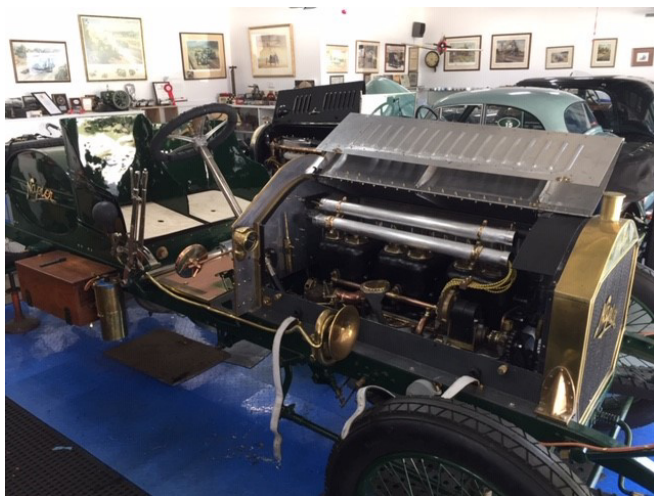
1907 40 hp Napier Tourer, which cost £1,295 in 1907 (a small fortune back then).