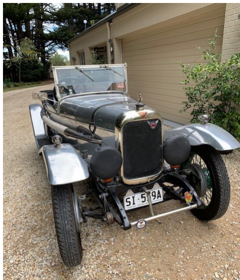
1924 Alvis 12/50 Ducksback which he has owned for 20 years and is his fun car.