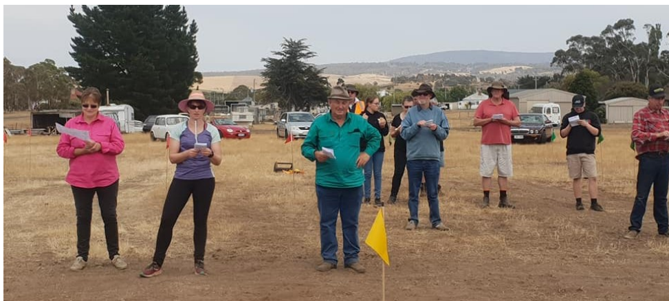
If we stand like this, it looks like there are more of us!