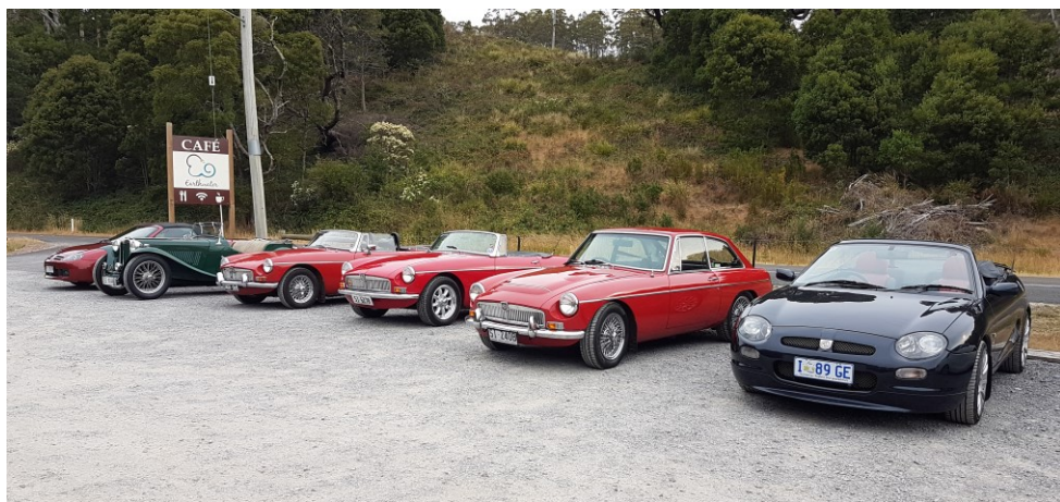
NW MG's at Earthwater Café, Mole Creek.