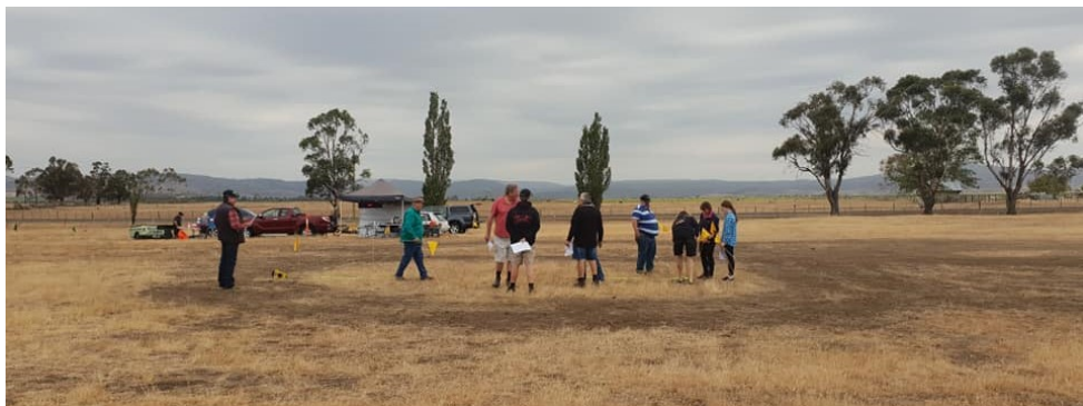
Hey, check out this Alien landing spot!