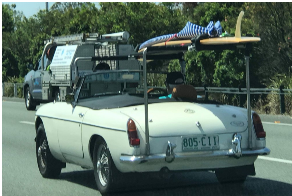
This MG B Surfer was spotted on the Hwy from Brisbane to Gold Coast just before Xmas.