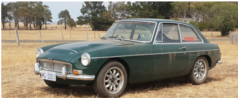
Craig Twinings MG C GT