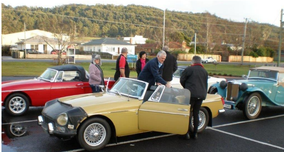
North West members prior to leaving Devonport