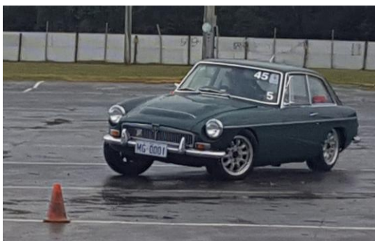
Craig Twining in the C