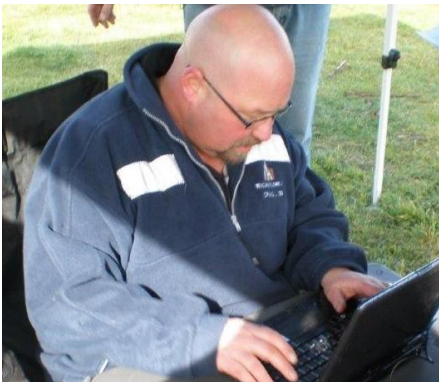
Our Club Captain at work