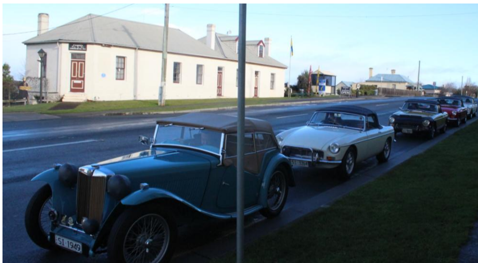
Northwest at Deloraine