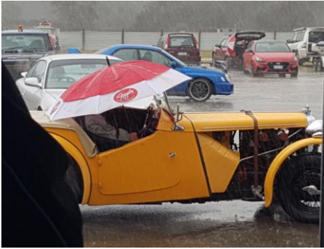
This is why T Types have marine ply floors