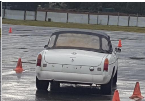
Craig Large in the start gate.

Written and Published by MG Car Club of Tasmania Inc. PRINT POST APPROVED PUBLICATION No. PP 100002891