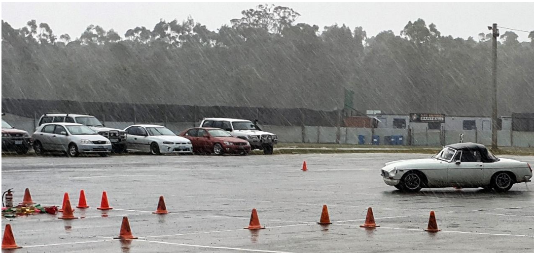
What do you mean it's only a bit wet?