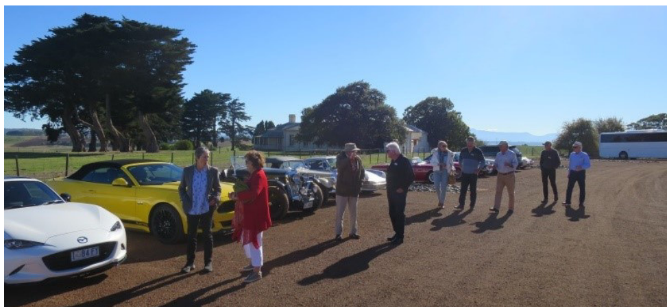
The gathering in the car park