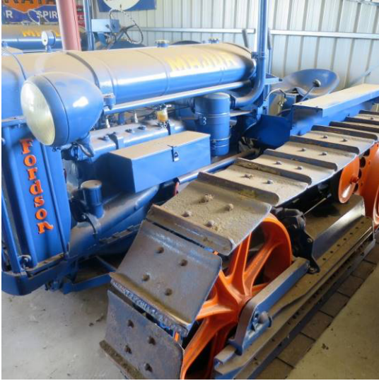
They are big toys and beautifully restored