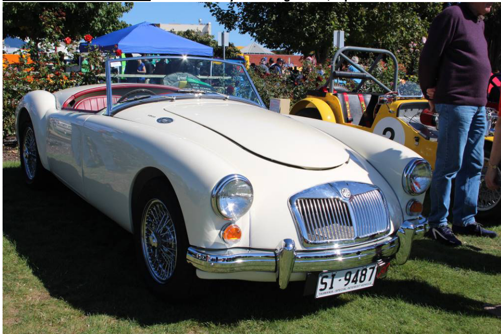
Wayne Jessup's Recently completed MGA 1500 at The Devonport Car Show