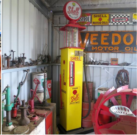
The artefacts to die for and all in operating order.