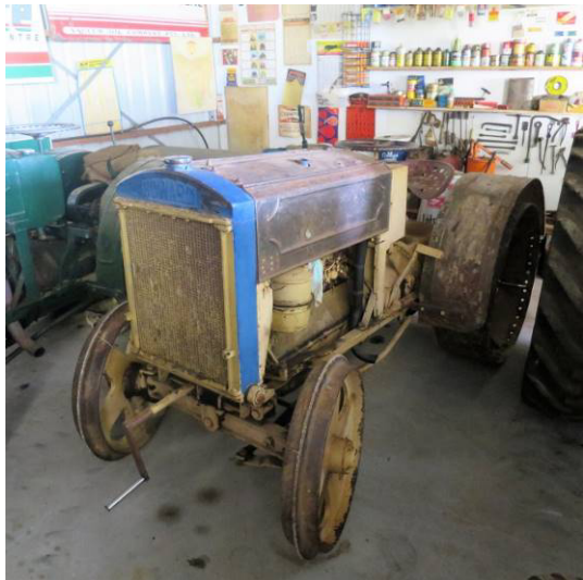
They are also very old and collectable