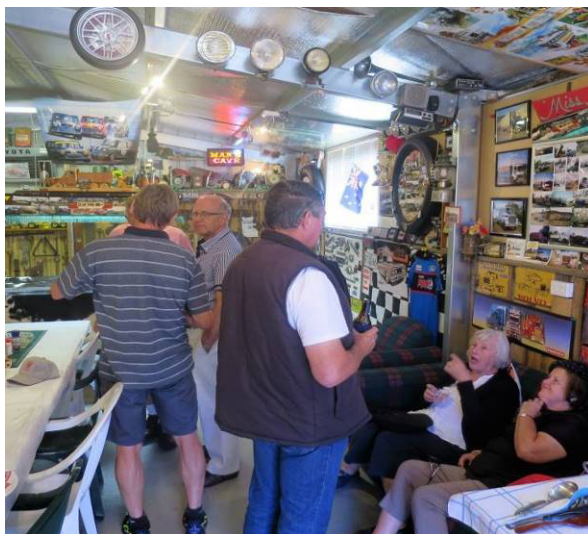
In Tony's Man Cave amongst the boys stuff .