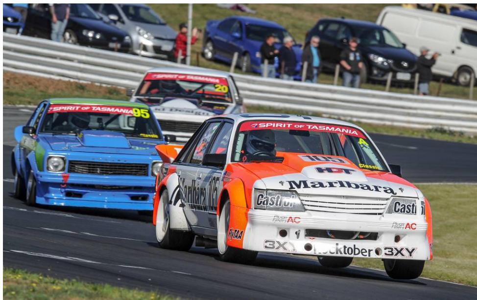
Muscle Car Cup_Baskerville Raceway.