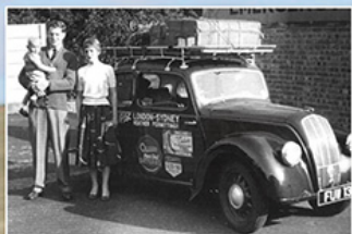
London to Sydney in a Morris 8