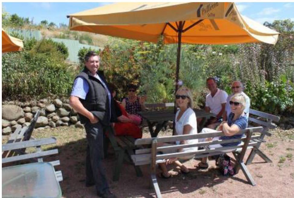
SSC members at Snug Tavern