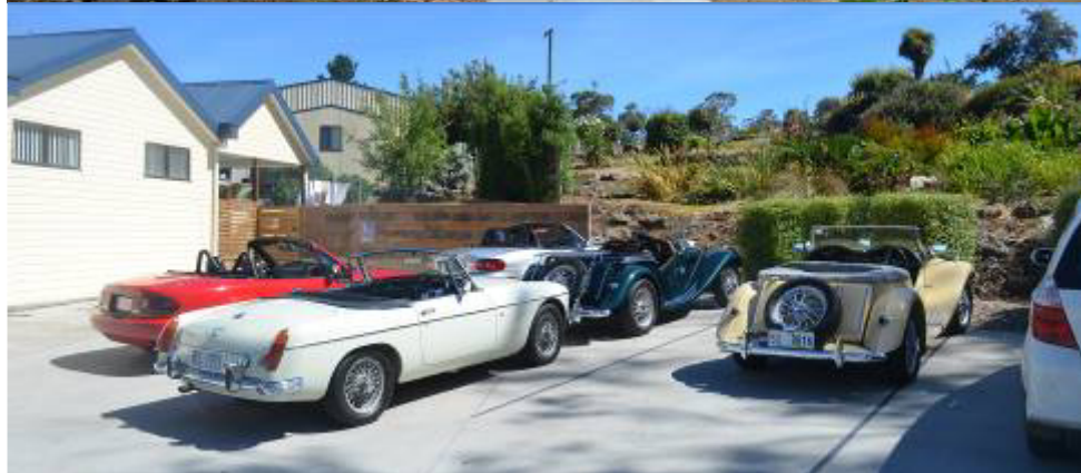
NSC Cars at the Jan 9 th Run to Hillwood Café.