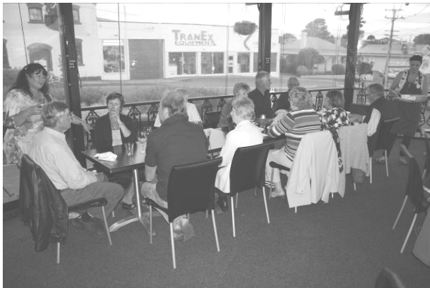
Tables of NW members at the Red Restaurant