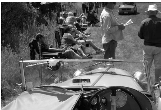
Looking through the windscreen on Phil's TC special at the row of spectators at Maxies.