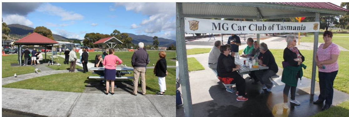
Members enjoying breakfast, the morning after the Annual Awards Dinner.