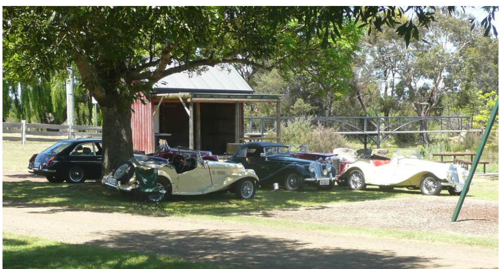
Congratulation to all drivers and crews throughout the year for yet another very successful Square Rigger series of events. Best Wishes to all for the Season