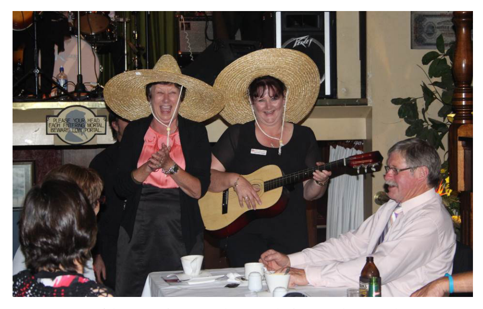
Part of the Entertainment at the Annual Dinner – The 2 Hombres

The growth of the event has meant that the organising committee has been expanded to include other clubs to assist in the organisation, promotion and running of the event. As we get closer to the November weekend updated will be provided in the magazine so you can get involved or just come along and support the event.