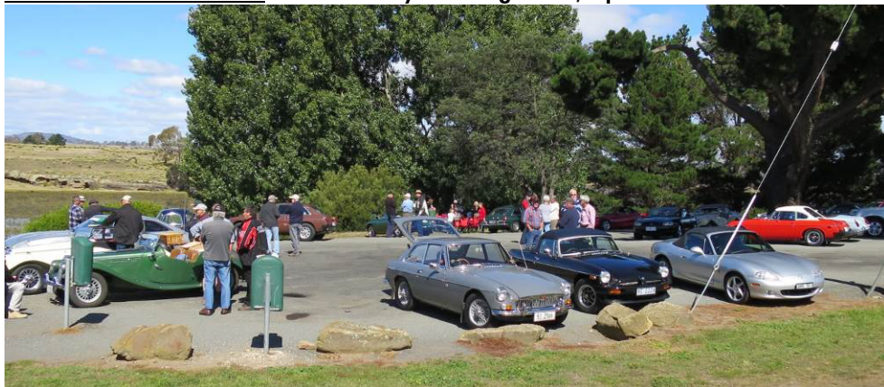
A view of most of the participants in the north south combined run.

The annual Devonport Car Show on 22 March 2015 clashed with the Longford revival but still managed over 500 cars on display.