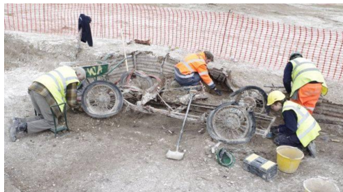
1932 MG J2 unearthed by archaeologists in England.